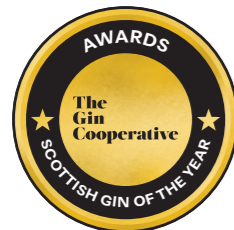
SCOTTISH GIN OF THE YEAR Gold, Silver, Bronze