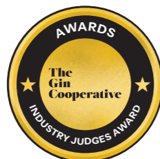
INDUSTRY JUDGES AWARD Gold, Silver, Bronze