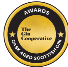
CASK AGED SCOTTISH GIN Gold, Silver, Bronze