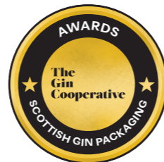
SCOTTISH GIN PACKAGING Gold, Silver, Bronze