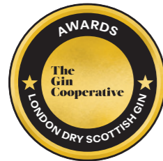
LONDON DRY SCOTTISH GIN Gold, Silver, Bronze