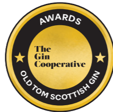
OLD TOM SCOTTISH GIN Gold, Silver, Bronze