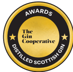
DISTILLED SCOTTISH GIN Gold, Silver, Bronze