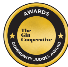
COMMUNITY JUDGES AWARD Gold, Silver, Bronze