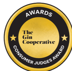
CONSUMER JUDGES AWARD Gold, Silver, Bronze