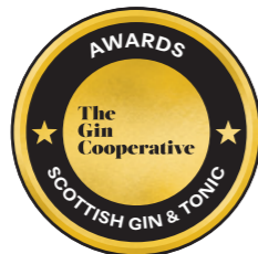
SCOTTISH GIN & TONIC Gold, Silver, Bronze