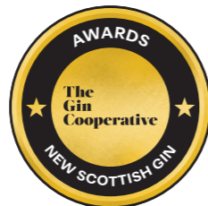
NEW SCOTTISH GIN* Gold, Silver, Bronze