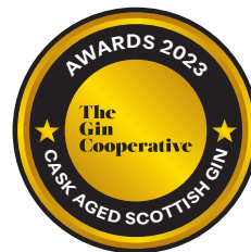
CASK AGED SCOTTISH GIN Gold, Silver, Bronze