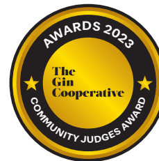
COMMUNITY JUDGES AWARD Gold, Silver, Bronze