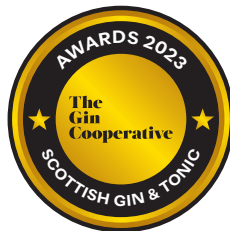
SCOTTISH GIN & TONIC Gold, Silver, Bronze