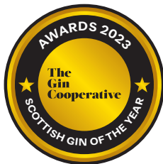
SCOTTISH GIN OF THE YEAR Gold, Silver, Bronze

Where applicable all entries will also be automatically entered into one or more of the following secondary award categories: