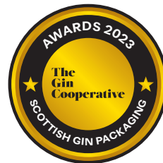
SCOTTISH GIN PACKAGING Gold, Silver, Bronze