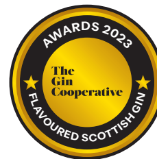
FLAVOURED SCOTTISH GIN Gold, Silver, Bronze