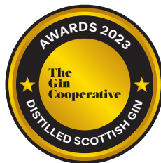
DISTILLED SCOTTISH GIN Gold, Silver, Bronze