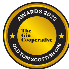
OLD TOM SCOTTISH GIN Gold, Silver, Bronze