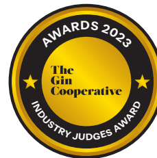
INDUSTRY JUDGES AWARD Gold, Silver, Bronze