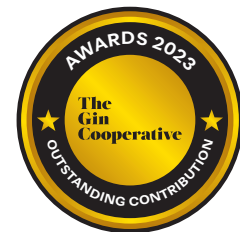
OUTSTANDING CONTRIBUTION Gold Award Only

Where applicable all entries will also be automatically entered into one or more of the following secondary award categories: