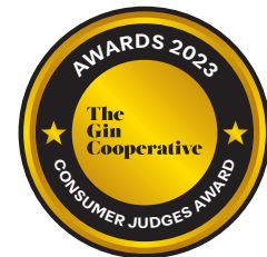
CONSUMER JUDGES AWARD Gold, Silver, Bronze