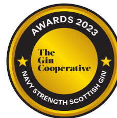
NAVY STRENGTH SCOTTISH GIN Gold, Silver, Bronze