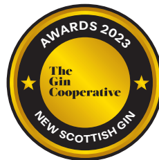
NEW SCOTTISH GIN Gold, Silver, Bronze