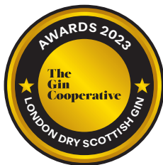
LONDON DRY SCOTTISH GIN Gold, Silver, Bronze